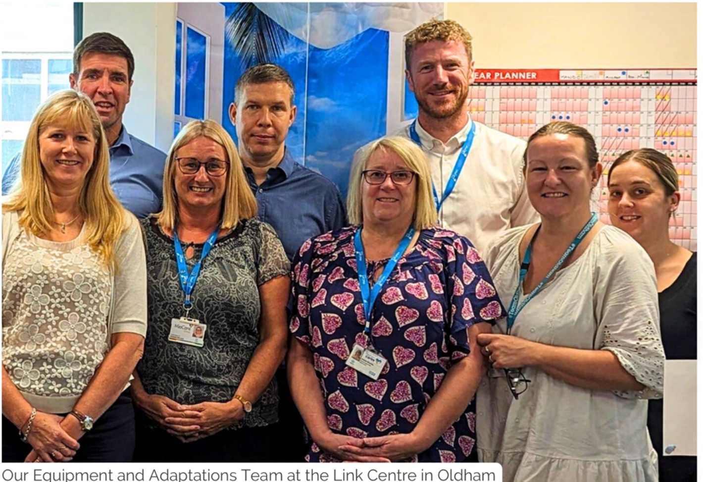
Our Equipment and Adaptations Team at the Link Centre in Oldham