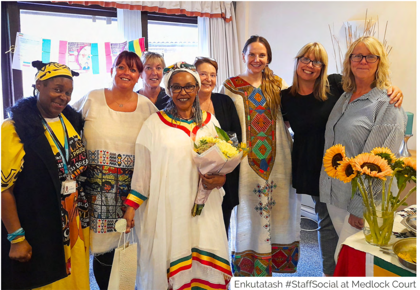
Enkutatash #StaffSocial at Medlock Court