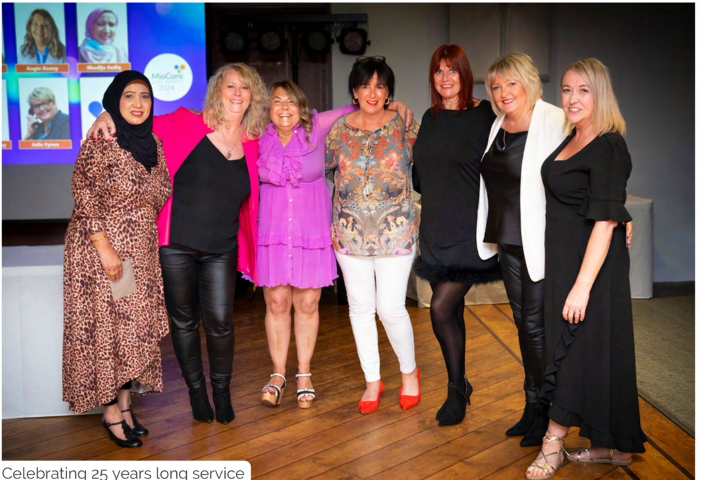
Celebrating 25 years long service