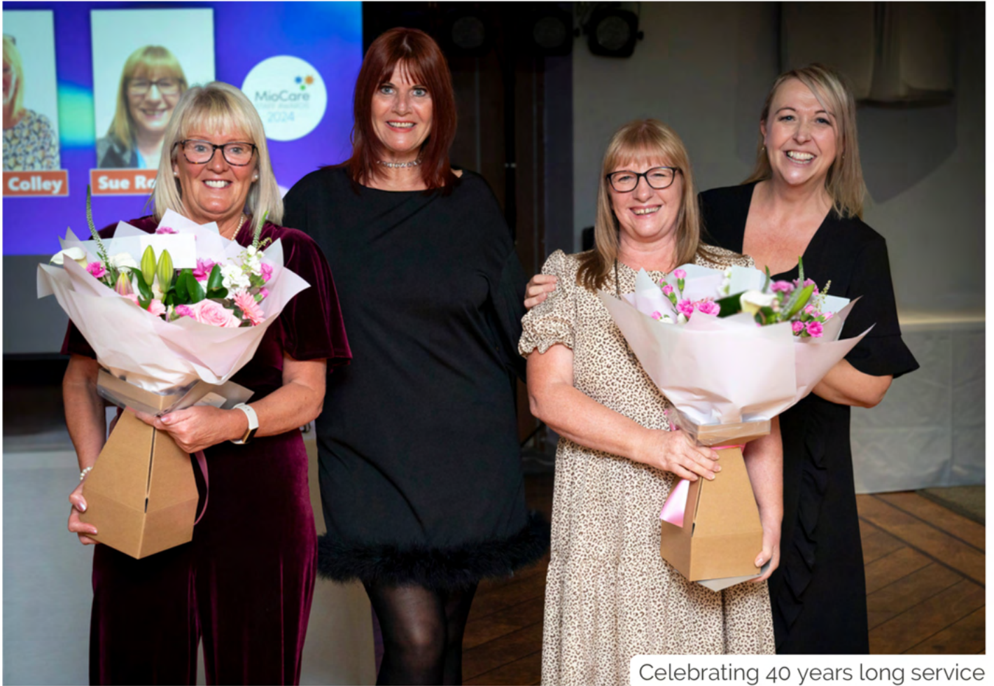
Celebrating 40 years long service