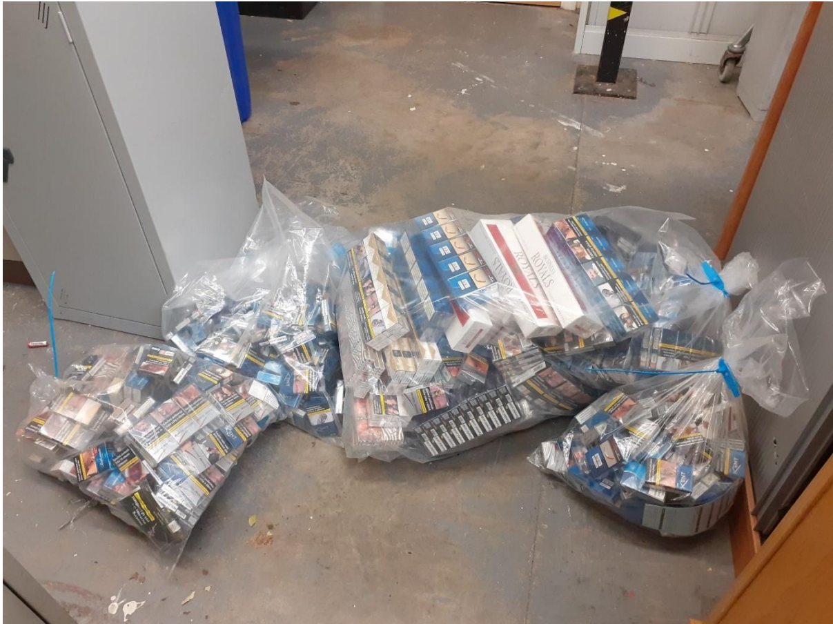
Photo of cigarettes seized from Timisoara on 19 th September 2020