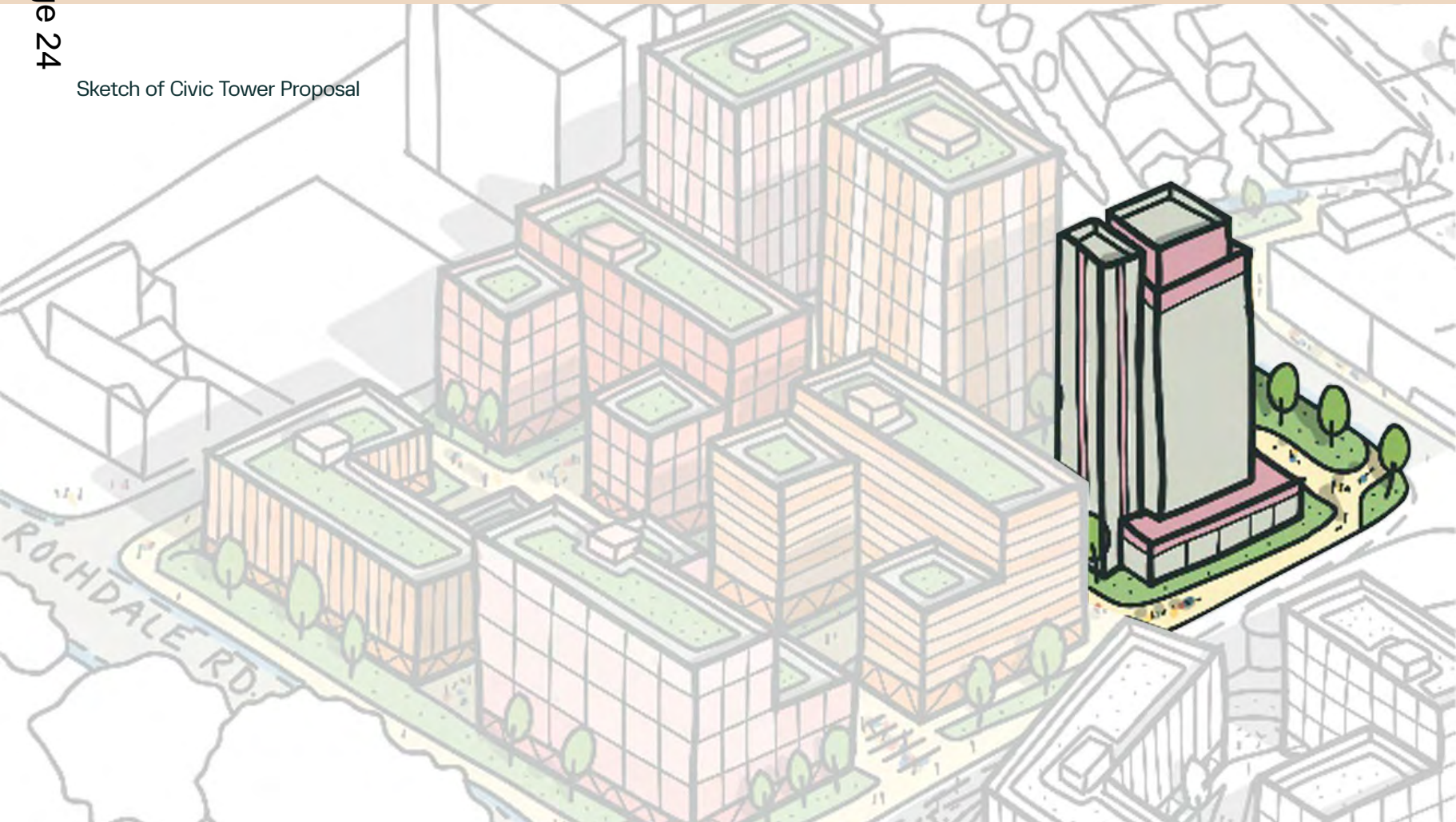
Sketch of Civic Tower Proposal