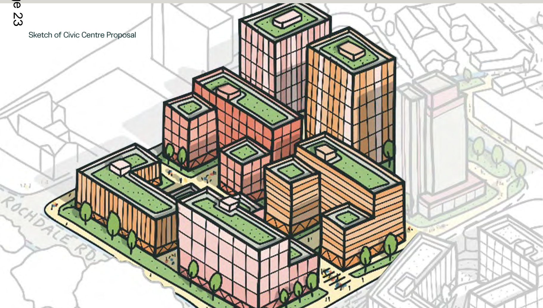
Sketch of Civic Centre Proposal