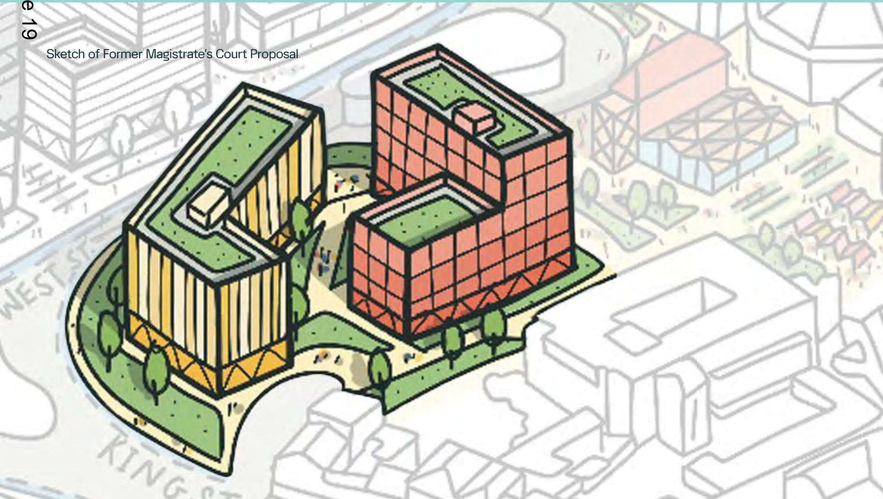
Sketch of Former Magistrate's Court Proposal