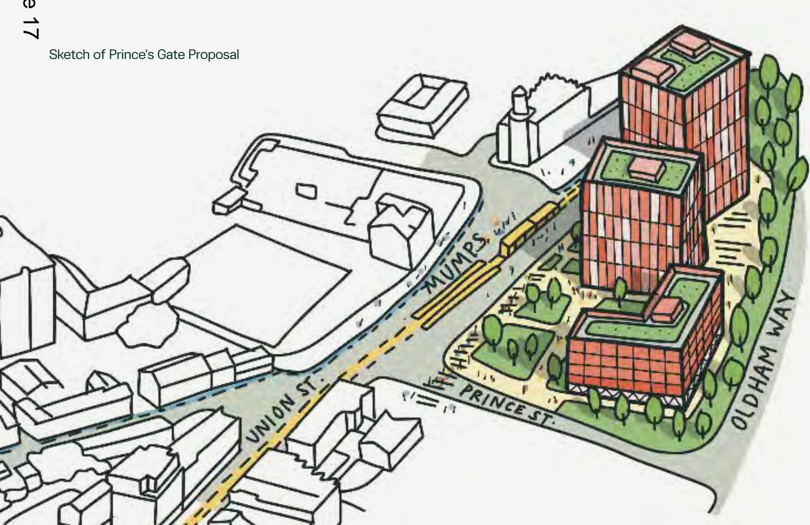
Sketch of Prince's Gate Proposal