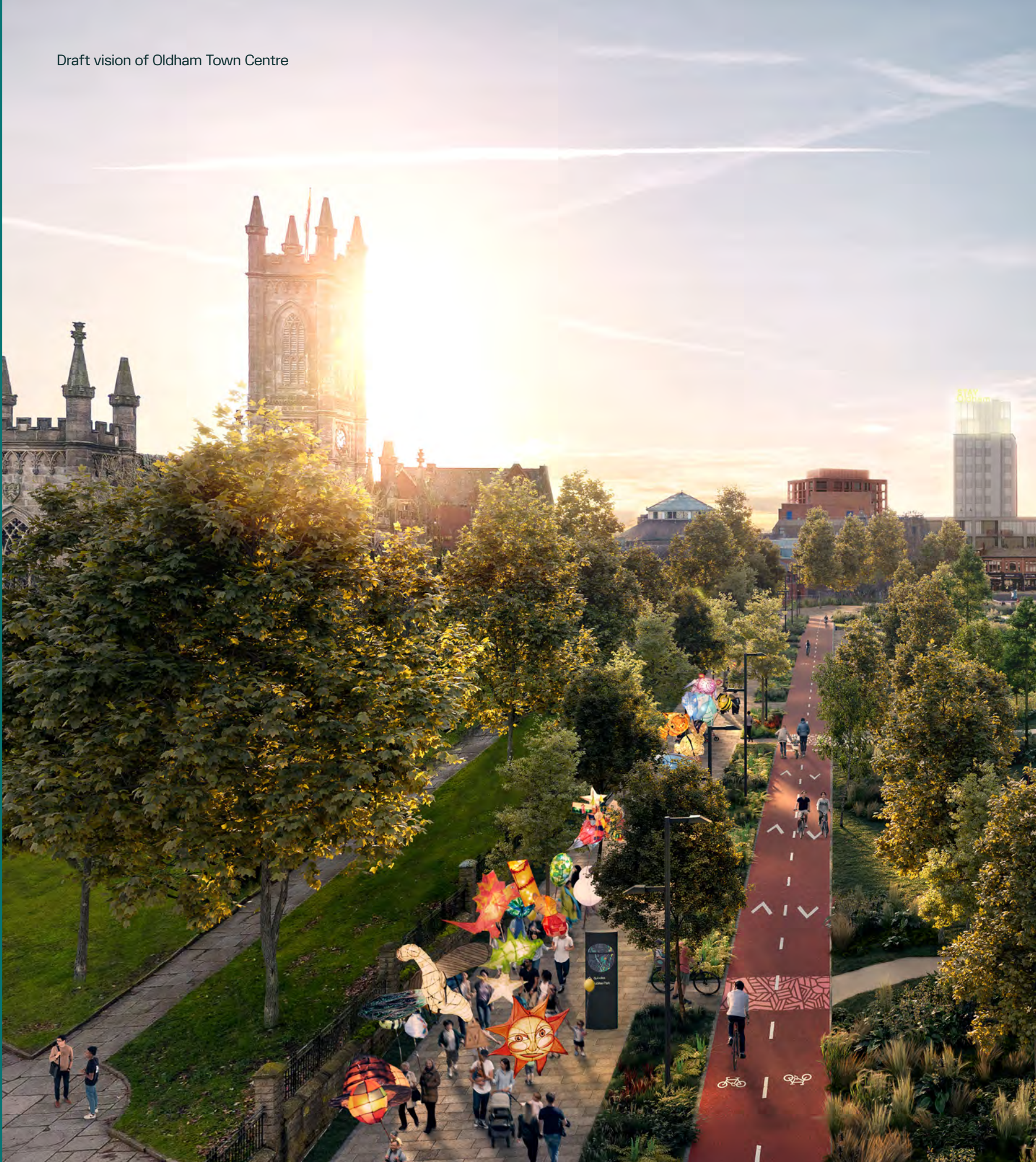
Draft vision of Oldham Town Centre