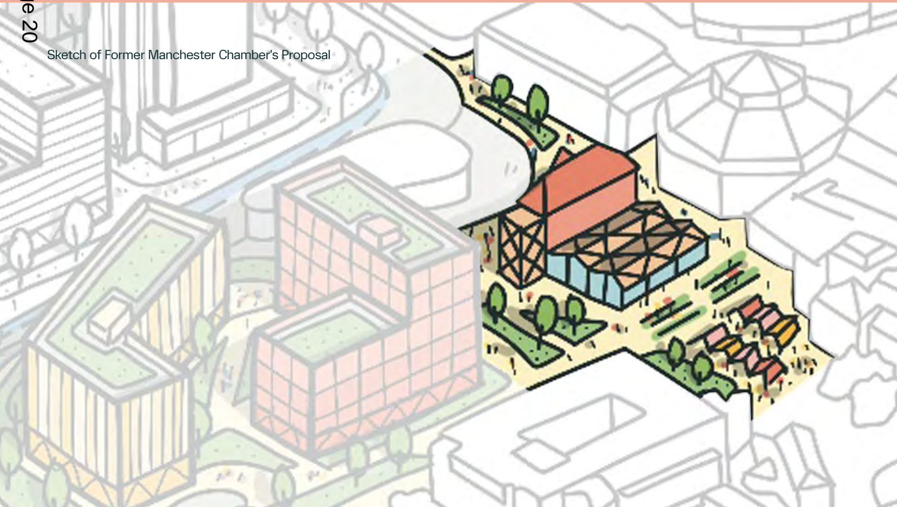
Sketch of Former Manchester Chamber's Proposal