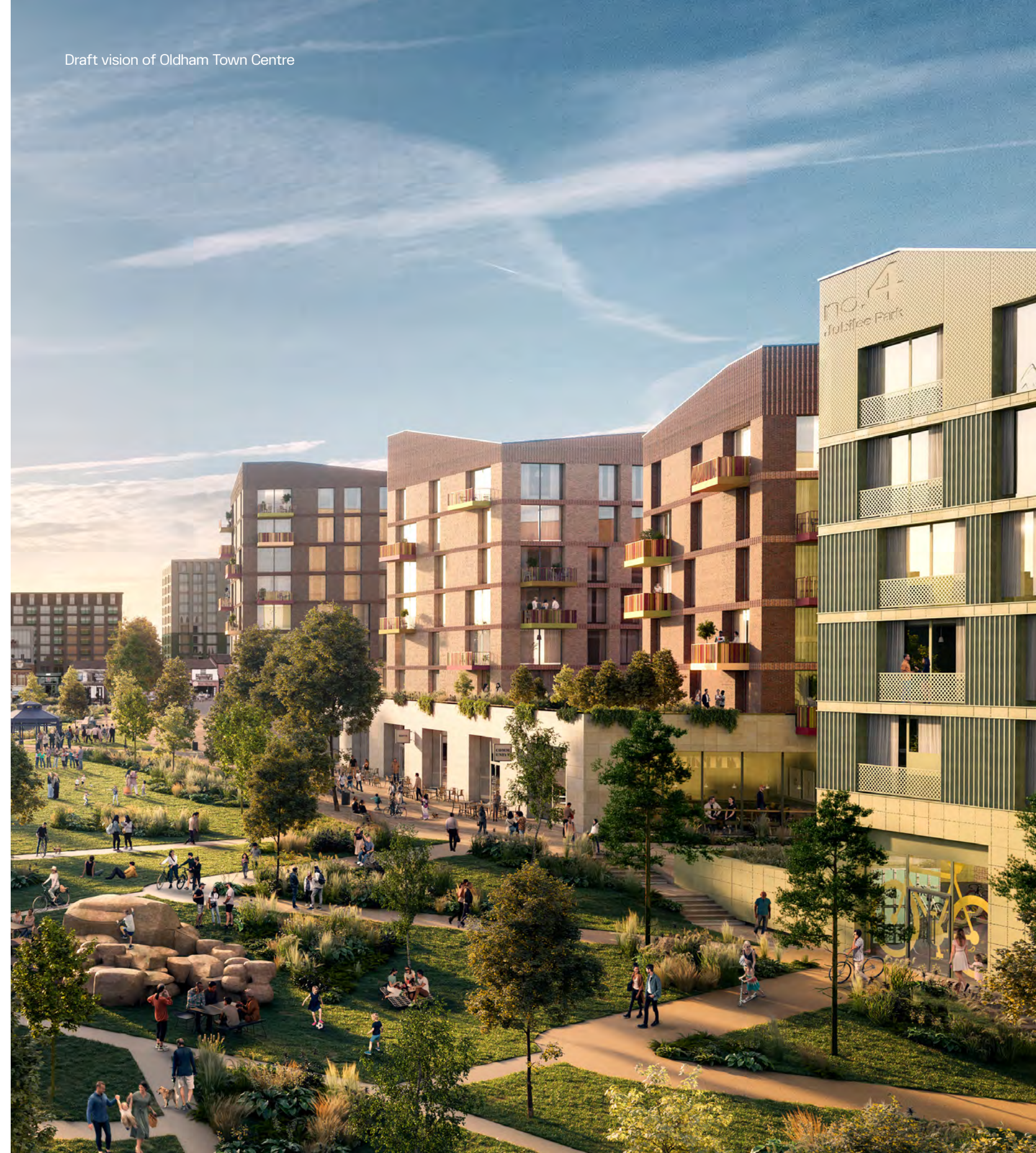
Draft vision of Oldham Town Centre

Muse is confident in the long-term viability of this scheme.