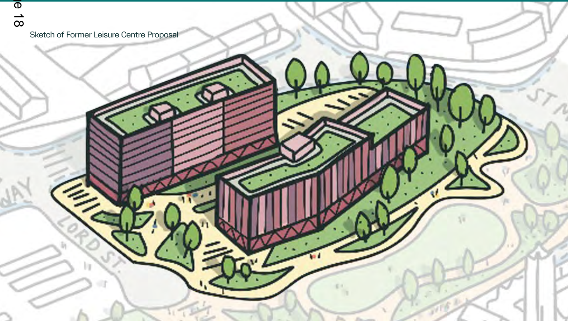
Sketch of Former Leisure Centre Proposal