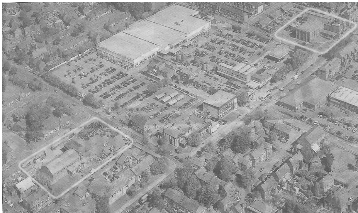
AERIAL view of the proposed new Baths (highlighted bottom left)