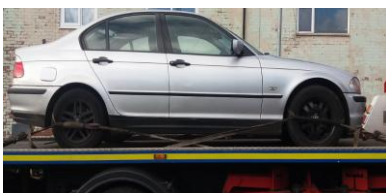
Vehicle seized for no tax or insurance on Lower Lime Road, Limeside